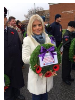
Nursing Students Active in RNAO Student Executive