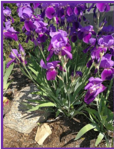
Circa 2018, St.Michael's College Garden/Bathurst Street Site/Toronto. (Parent Alumni)

The purple Irises represent, historically and still TODAY in modern times, royalty first and foremost. Then, the upright petals symbolize: WISDOM, FAITH AND BRAVERY . How suitable it could become the floral emblem for the Faith Community Nurses!!